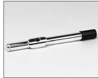
head joint with tenon cover